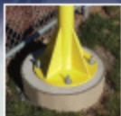
Unique JWI mounting system provides secure installation